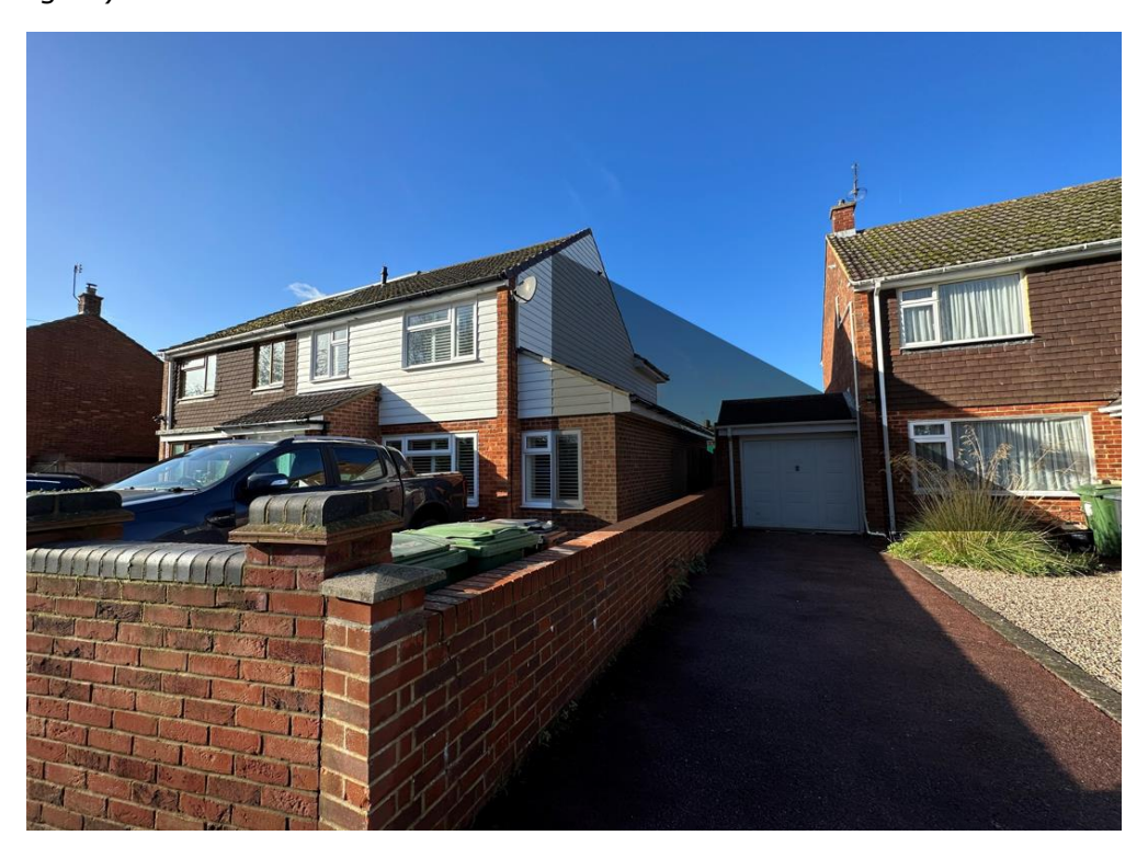
Image 1: Indicative image showing assessment of shadow cast by the proposed side extension onto no.69 Robins Close

6.14 As the application property is to the south of the neighbouring property at no.69, further assessment was carried out to identify the shadow path of the proposed development and it was found that the shadow falling from the proposed extension onto no. 69 would be lower than the shadow cast by the roof of the existing dwelling (Image 1).